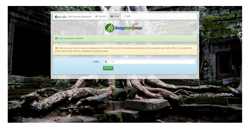
Figure 5: Self Service Password

Other free software LDAP implementations