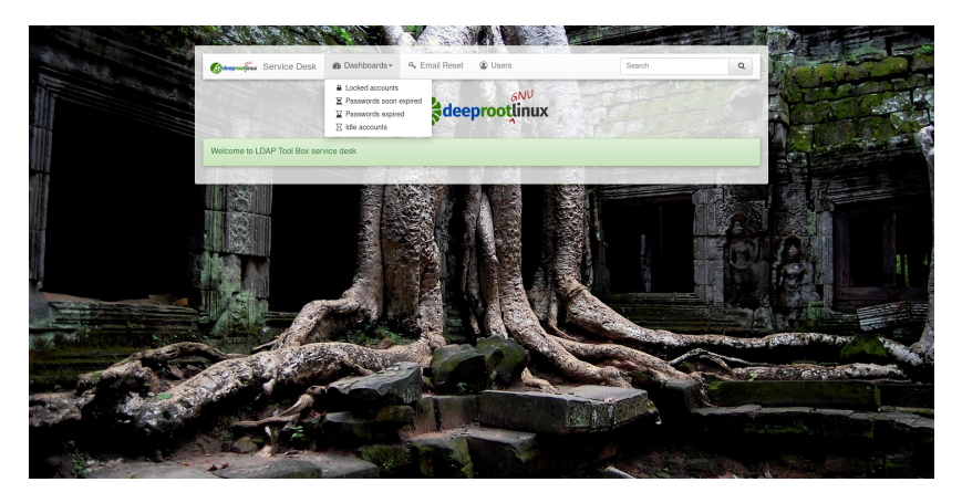
Figure 4: Service-Desk